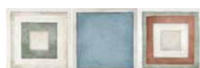
VLC100/44 139 ■ Village Color Riquadri (12 pz misti - 12 pcs mix) 25x75 10"x30"