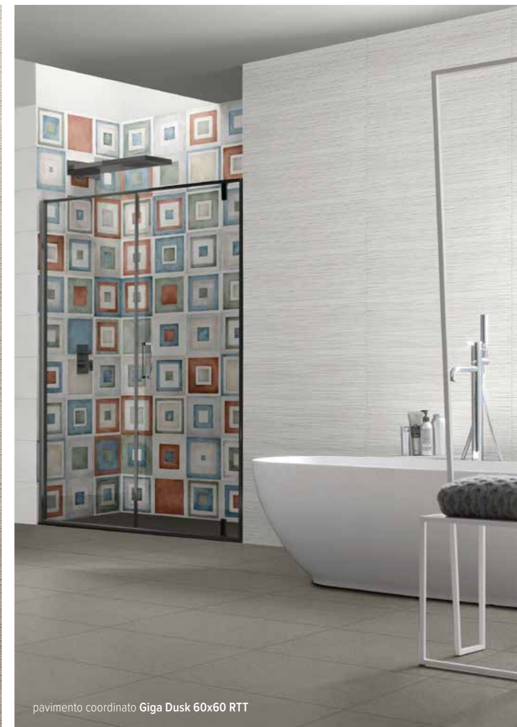
pavimento coordinato Giga Dusk 60x60 RTT