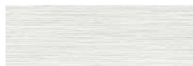
VLC011/44 139 ■ Village Color Cannetta Bianco 25x75 10"x30"