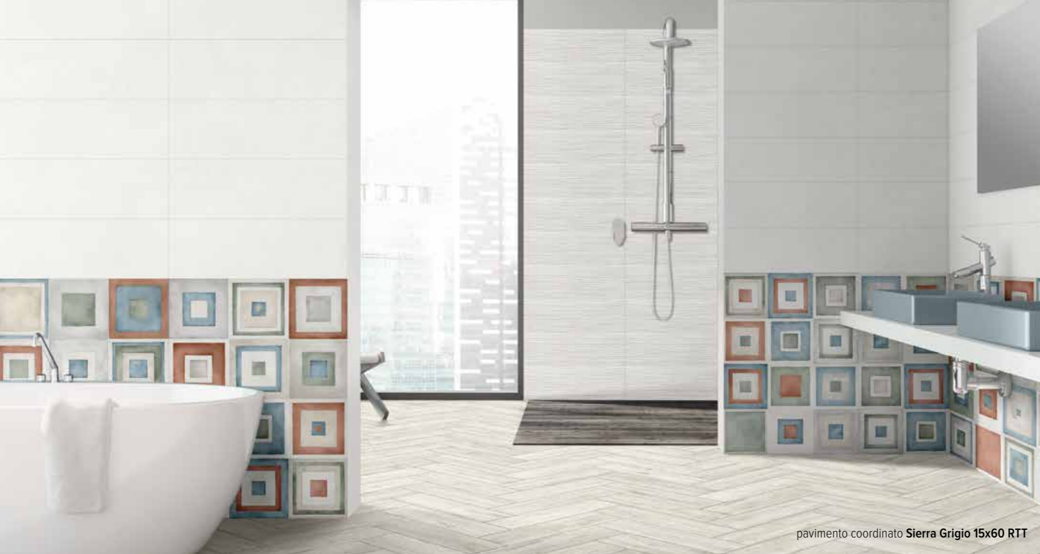
pavimento coordinato Sierra Grigio 15x60 RTT