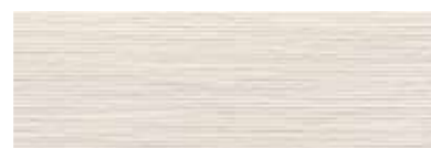
VLC012/44 139 ■ Village Color Cannetta Crema 25x75 10"x30"