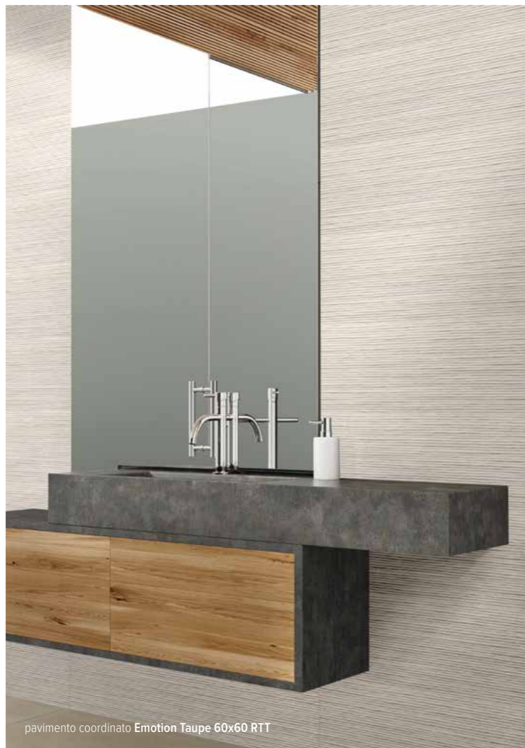
pavimento coordinato Emotion Taupe 60x60 RTT