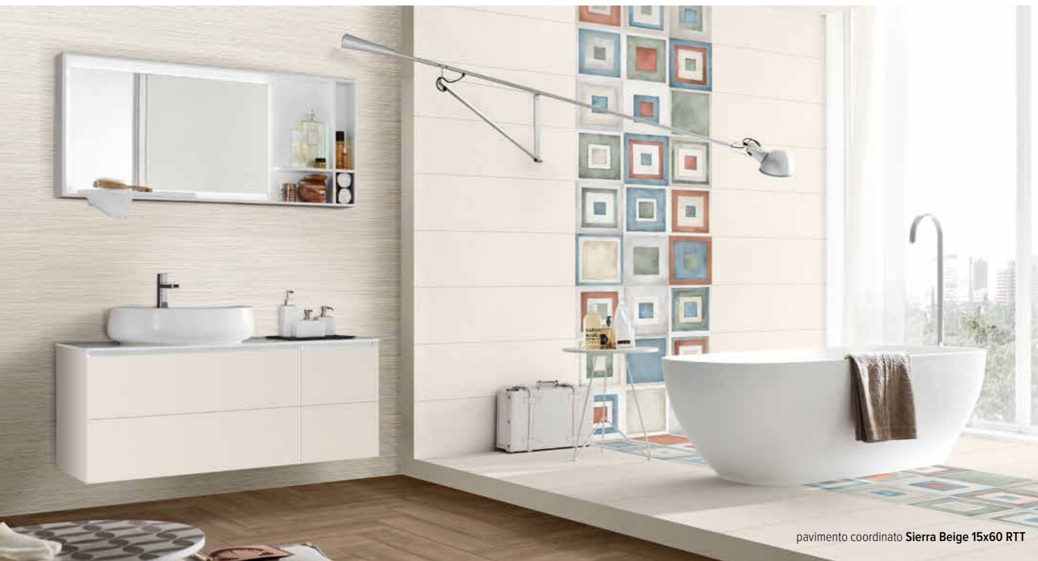
pavimento coordinato Sierra Beige 15x60 RTT